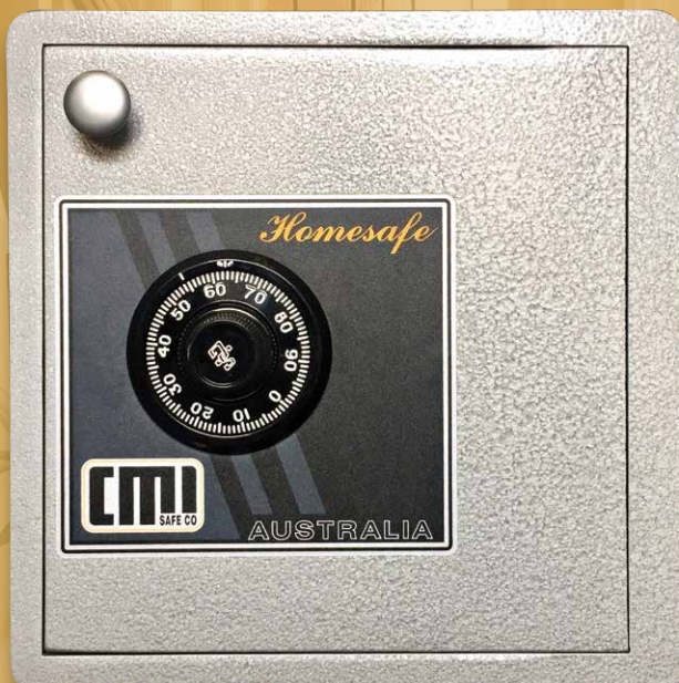
■ MODEL HS5