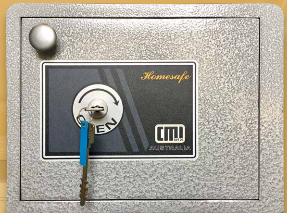
■ MODEL HS4