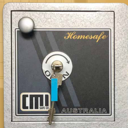
■ MODEL HS2